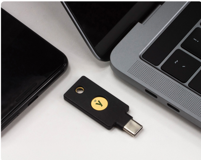
YubiKeys deliver strong user authentication across platforms and devices

Yubico is the principal inventor of the WebAuthn/FIDO2 and FIDO U2F authentication standards adopted by the FIDO Alliance and is the first company to produce the U2F security key and a multi-protocol FIDO2 authenticator.